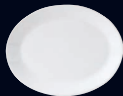
C345 Oval Plate 33.0cm (13") C341 28.0cm (11") C339 20.25cm (8")