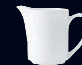
C669 Vogue Jug 28.5cl (10oz) C670 Vogue Jug 14.25cl (5oz) C678 Vogue Jug 8.0cl (2½oz) Unhandled