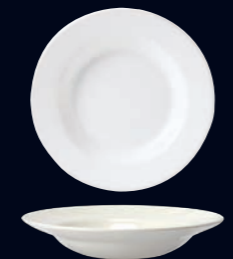
C363 Soup/Pasta 24.0cm (9½")