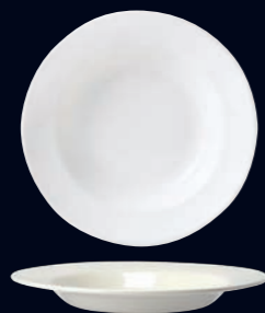
C350 Pasta Dish 30.0cm (11¾")