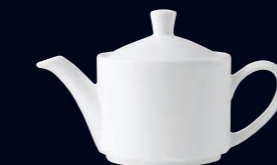
C660 Vogue Teapot 85.25cl (30oz) C665 Lid 1 C661 Vogue Teapot 42.5cl (15oz) C666 Lid 2 C679 Vogue Teapot 34.0cl (12oz) C666 Lid 2