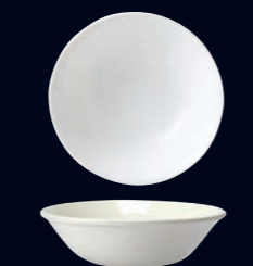
C325 Bowl 20.0cm (8") C326 16.5cm (6½")