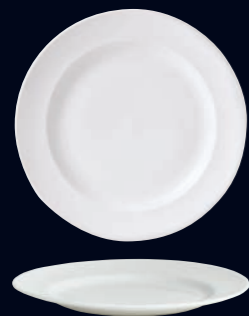
C356 Plate Vogue 32.0cm (12½") C357 30.0cm (11¾") C358 27.0cm (10¾") C359 25.5cm (10") C360 23.0cm (9") C361 20.25cm (8") C362 16.5cm (6½")