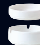
C044 Tray Stacking 10.25cm (4") C046 Tray Stacking 7.5cm (3") C045 Ash Tray 10.25cm (4")