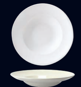
C365 Nouveau Bowl 30.0cm (11¾") C372 27.0cm (10¾") C377 23.0cm (9") C378 18.0cm (7")