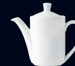
C662 Vogue Coffee Pot 85.25cl (30oz) C666 Lid 2 C663 Vogue Coffee Pot 60.0cl (21oz) C667 Lid 3 C664 Vogue Coffee Pot 31.0cl (11oz) C668 Lid 4