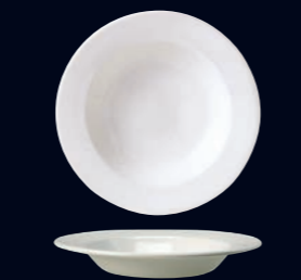
C310 Soup Plate 22.25cm (8¾")