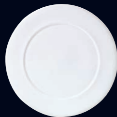
C347 Presentation Plate 30.5cm (12")