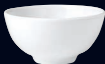
C247 Bowl 15.9cm (6¼") 80.25cl (28oz) C242 12.7cm (5") 45.75cl (16oz) C248 11.2cm (4½") 25.5cl (9oz) C249 10.3cm (4") 20.0cl (7oz) C240 9.4cm (3¾") 12.75cl (4½oz)