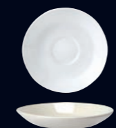
C318 Saucer 15.25cm (6") C317 11.75cm (4¾")