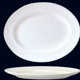
C392 Oval Plate Vogue 33.0cm (13") C393 28.0cm (11") C394 20.25cm (8")