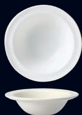
C330 Rim Fruit 16.5cm (6½") C329 13.5cm (5¼")