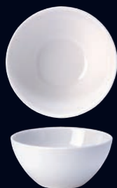
C251 Bowl 13.0cm (5¼") C254 10.0cm (4")