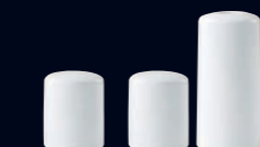
C675 Vogue Salt C676 Vogue Pepper C677 Vogue Bud Vase