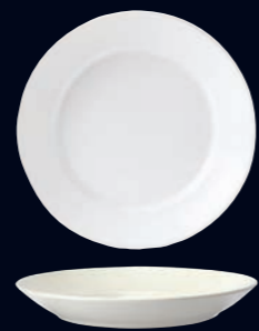
C344 Ultimate Bowl 30.0cm (11¾")