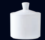
C673 Vogue Sugar Pot Covered Complete C674 Vogue Lid for Covered Sugar